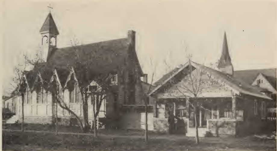
SAINT GEORGE'S CHURCH AND PARISH HOUSE, BISMARCK

the early morning and at dinner time in the evening. In addition, two other girls are partially assisted. We try to secure homes for our Church girls who go to Valley City, but we do not always succeed in filling the house with Church girls. One of the rules of the hall is that all the girls must go to church on Sunday morning and Sunday evening. Our own girls attend our parish church of All Saints and are always most regular in their attendance upon the early Communion. The girls of other communions attend their own churches in the morning. Family prayers are said every evening in the hall. The principal of the normal school speaks in the most appreciative terms of the work of our Church Hall.